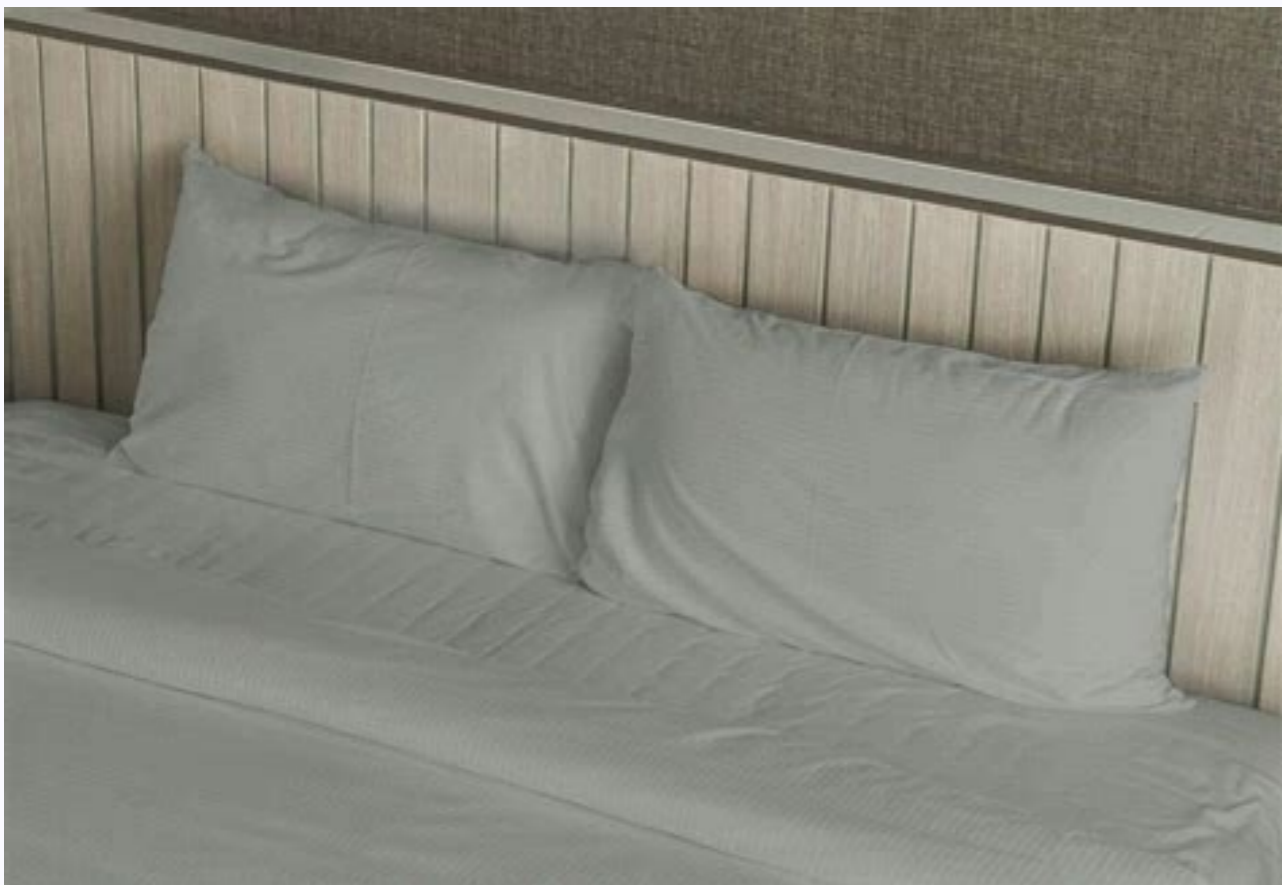
Higher thread count sheets hotter. Are 1000 thread count sheets hotter. Does higher thread count mean hotter sheets. Are higher thread count sheets better. Are 1200 thread count sheets hot. Does high thread count sheets make you hot.